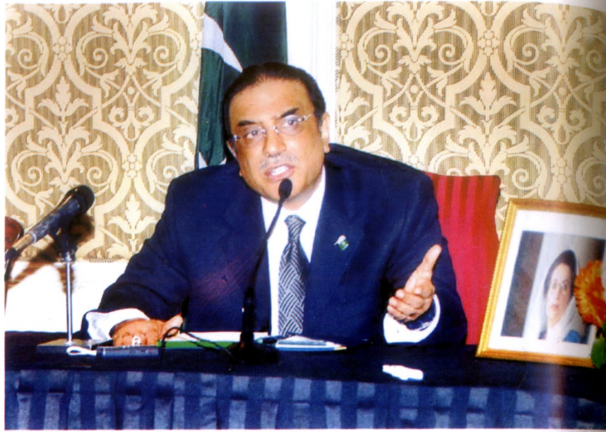
شریک چیئر پرسن پاکستان پیپلز پارٹی صدر پاکستان جناب آصف علی زرداری