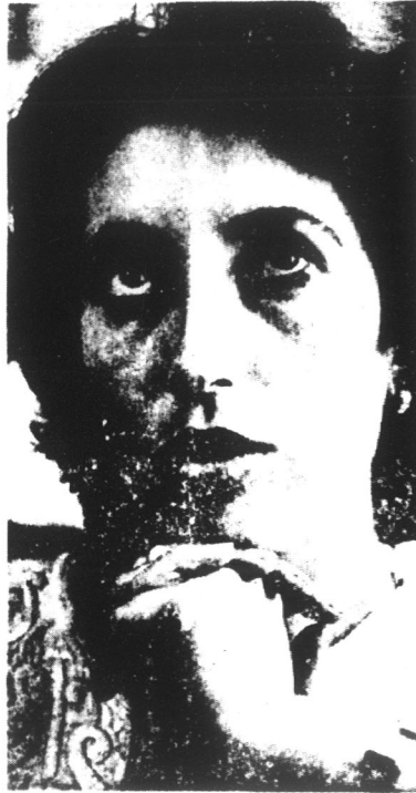
Pakistan's next leader? Bhutto in London last week

She returns to Pakistan as acting chairwoman of her party. She insists that her mother is the party's real leader but she is the only Pakistani who appears to believe this. Her mother has not been well for several years and will stay behind in the south of France, when Benazir goes back. Benazir is